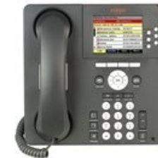
9640 and 9640G