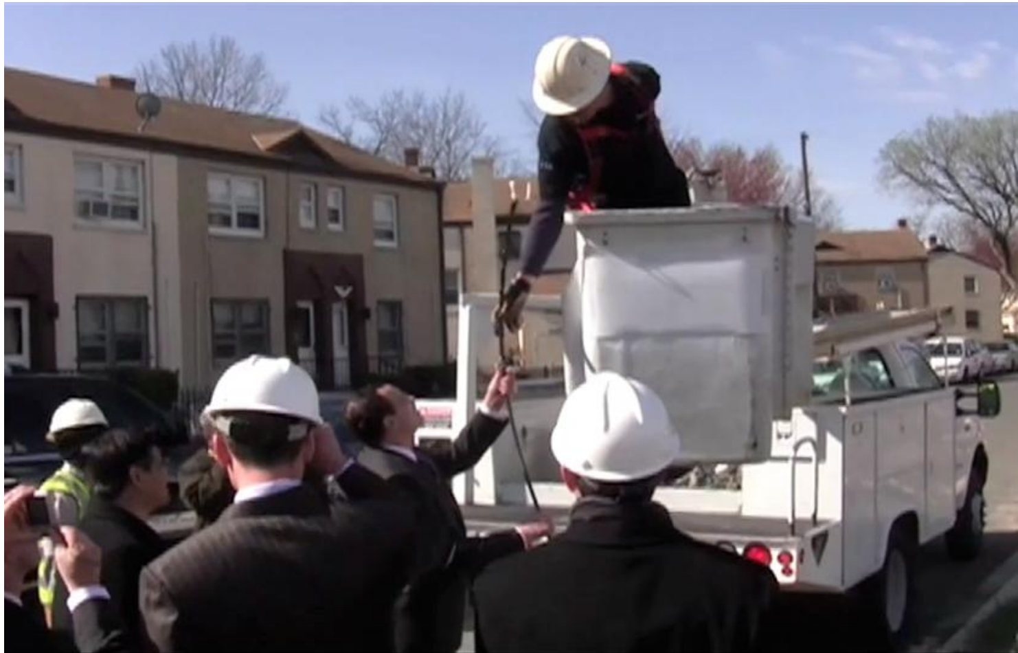
DC-CAN fiber construction begins March 29, 2011 at Barry Farm in Ward 8